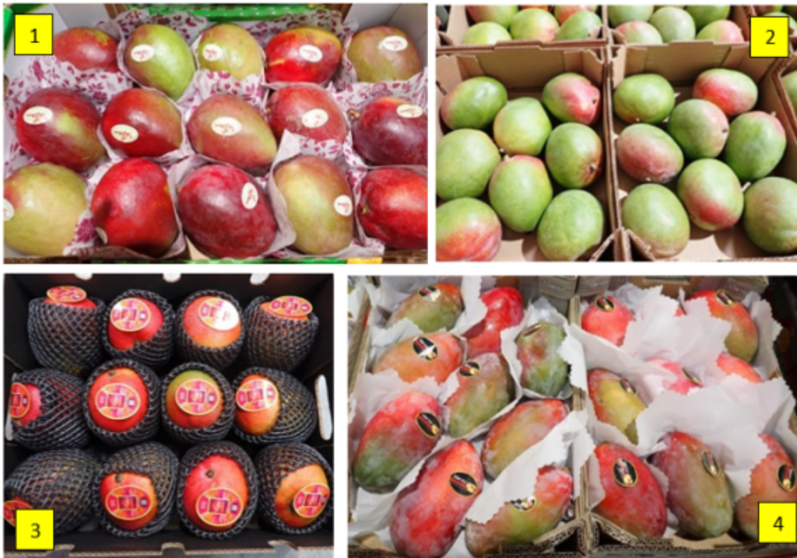
Figure 2: Mango varieties Kasturi/Israel (1), Kent/Peru (2), Kent/Peru airfreight (3), Osteen/Spain (4)