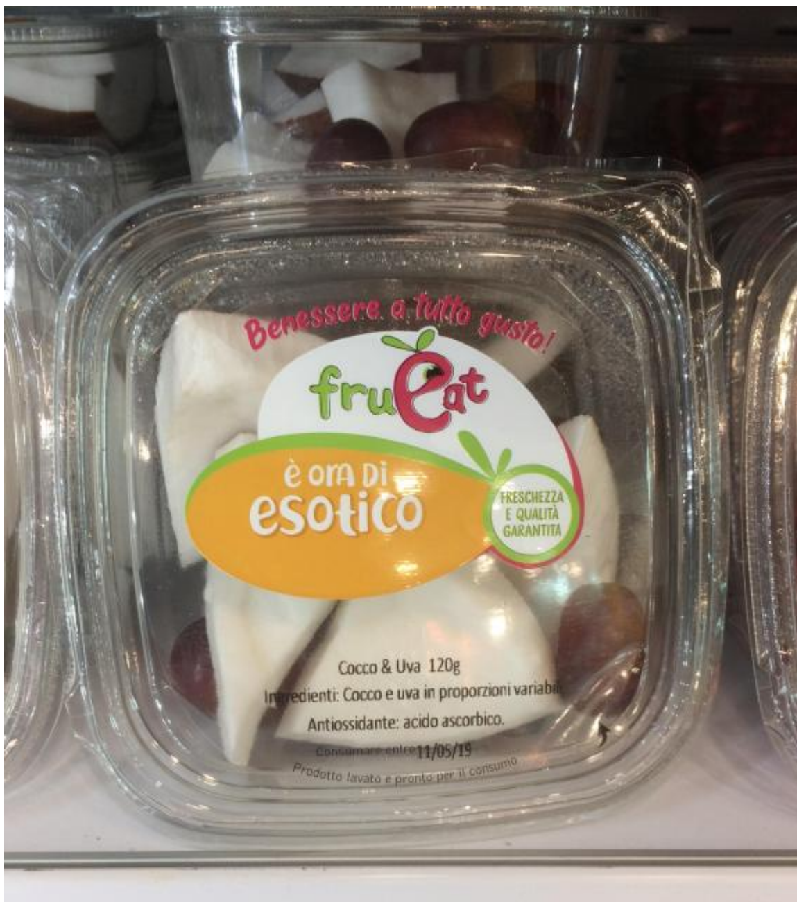
Figure 5: Example of fresh-cut coconut in an Italian supermarket

Retailers more and more offer packaged, freshly cut coconut (see figure 5). Freshly cut coconut has seen strong growth just like other freshly cut, tropical fruit, such as mango, pineapple and papaya. It is convenient and practical in logistics and distribution. Therefore, you can expect this pre-packaged segment to increase. A supplier that has successfully tapped into the freshly cut trend is INI Farms in India that works exclusively with Sous Fresh (part of the Best Fresh group ) for the distribution to wholesalers and food services in Europe.