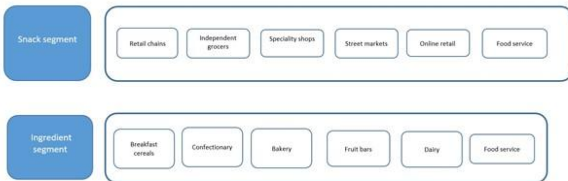
Figure 1: End market segments for dried tropical fruit in Europe