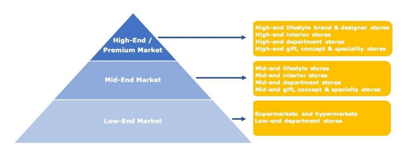
Figure 1: Vase market segmentation in Europe