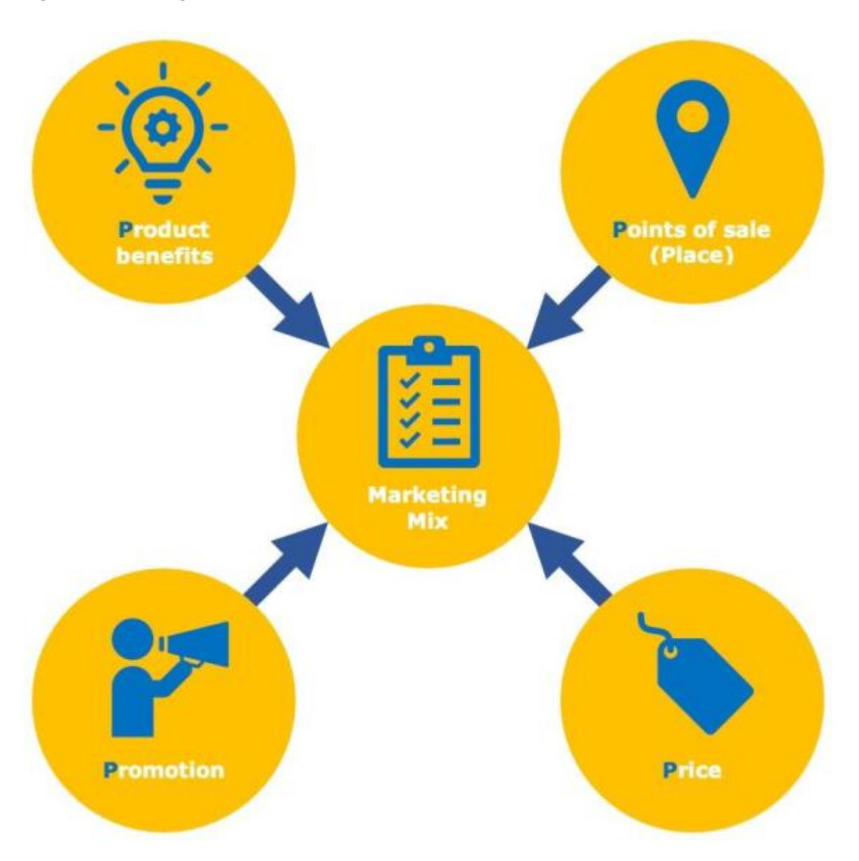
Figure 8: Marketing mix - the 4 Ps