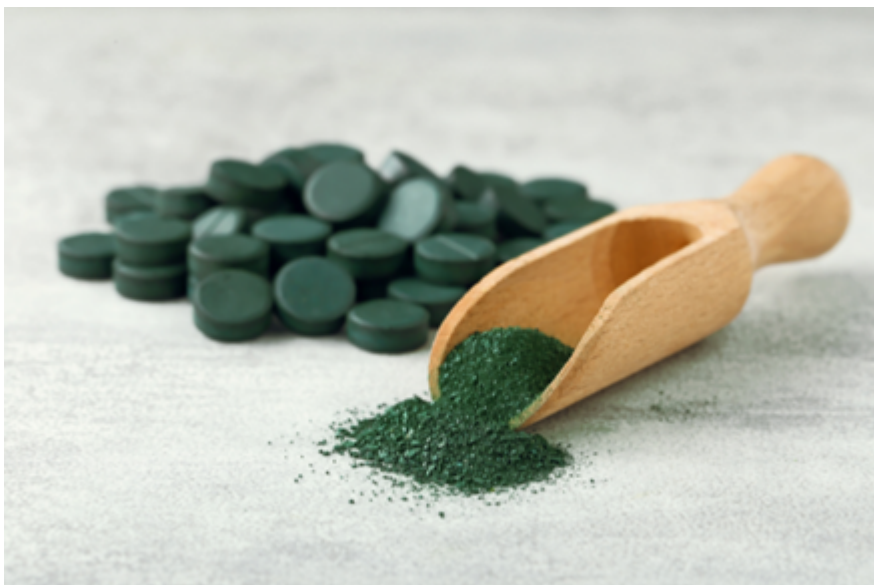
Figure 4: Spirulina tablets and powder

The health benefits of spirulina include being high in omega-3 fatty acids, riboflavin, thiamine, iron and copper. The health benefits of chlorella include riboflavin, thiamine, iron and copper. Spirulina and chlorella are therefore rival products to moringa.