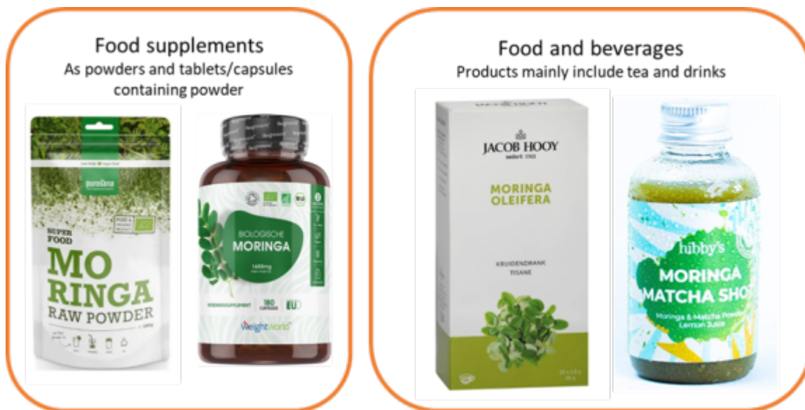
Figure 1: End-market segmentation for baobab products

Sources: Purasana, Bol.com, Holland & Barrett, Amazon.co.uk