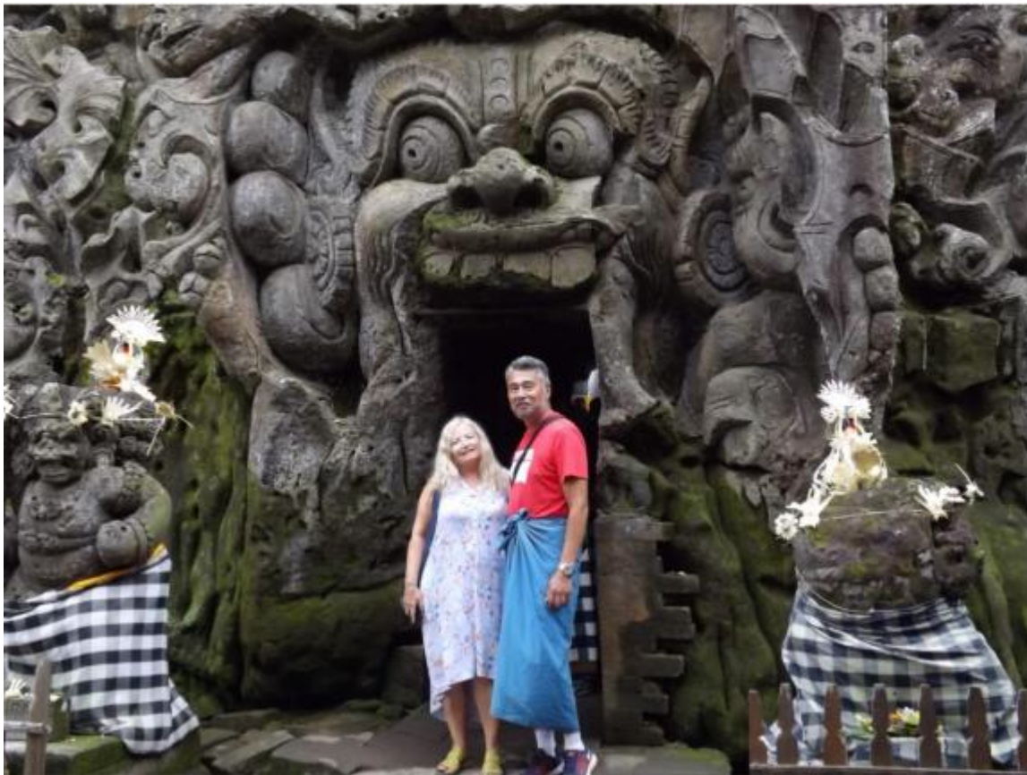
Figure 8: Baby Boomers visiting a Hindu temple in Bali

The demand for slow travel has also increased. The concept of slow travel is travelling slowly, staying longer and more locally, and making closer connections to the people and region. This allows travellers to connect more fully with their destination and to immerse themselves in the local culture. 86% of providers in South Africa said they had seen more demand for slow travel compared to last year, and 84% said the demand for slow travel will continue to grow.