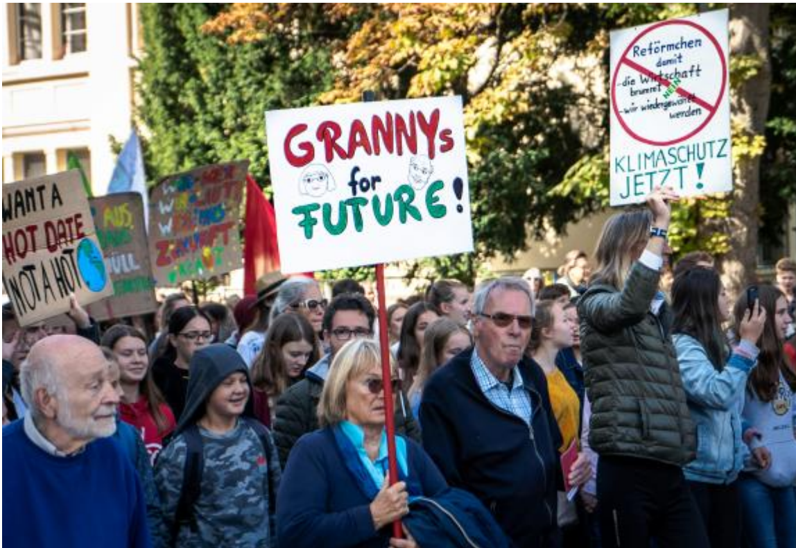
Figure 10: Baby Boomers protesting for climate action