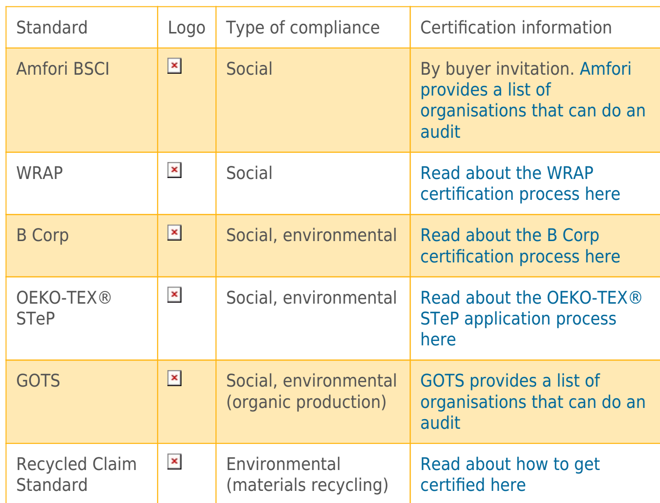
Table 1: Europe's most popular standards